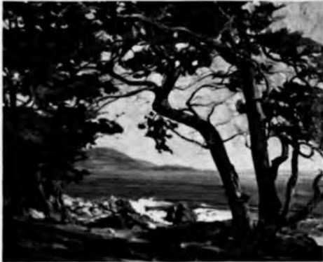
WILLIAM WOOD AT CAMP BEMIS . . . oil