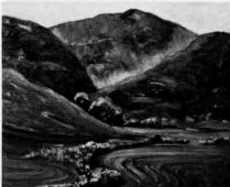
ELLSWORTH YOUNG STILL WATERS . . . oil