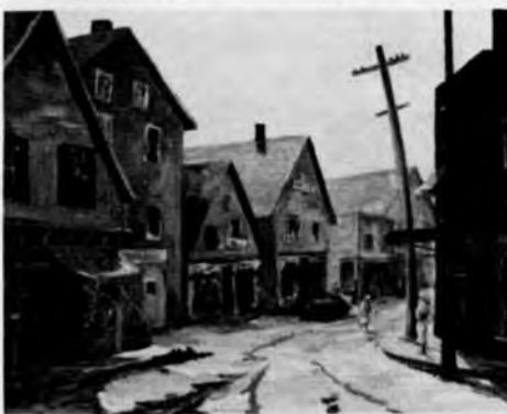
ETHEL BLAINE PORTER NUNDY . . . oil