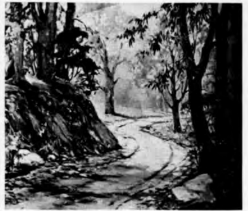
GAYE WOODRING COONS AUTUMN FAIRYLAND . . . oil