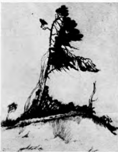
ERNEST MELCHERT WINDSWEPT . . . dry point etching