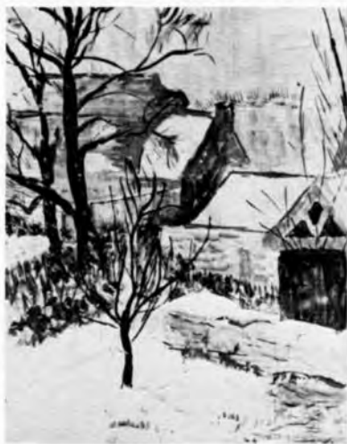
ELIZABETH HURD HAMILTON WINTER FROM THE TERRACE . . . water color