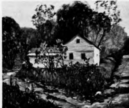
• ALICE CAVENDER LAGUNA CANYON . . . oil