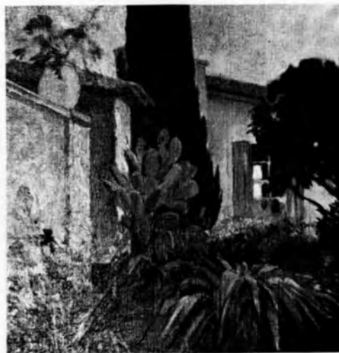
CAROLINE LIVINGSTON ECKART THE BLUE SHUTTER . . . oil