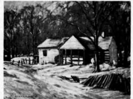
ORVAL CALDWELL HAUNTED HOUSE . . . oil