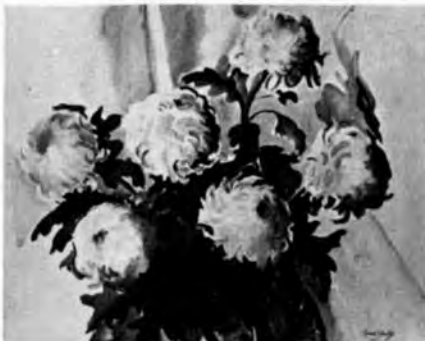
IRENE SCHULTZ CHRYSANTHEMUMS . . . water color