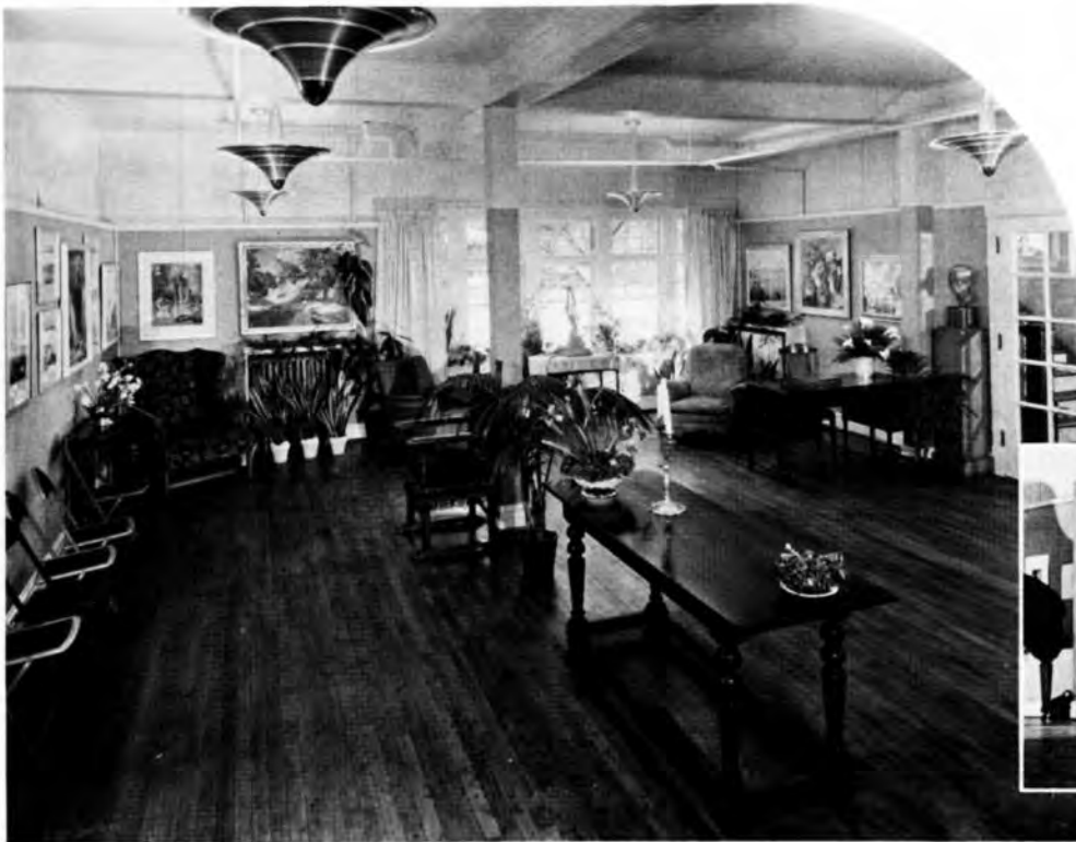
Studio setting for Art League suppers, lectures, parties and Sunday teas