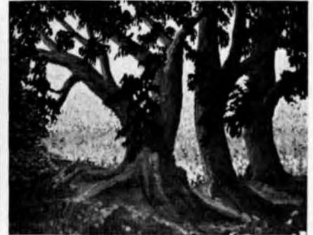
EMIL DEFFNER EARTH'S SWEET FLOWING BREAST . . . oil