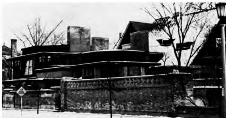
Studio home of the architect Frank Lloyd Wright and former center of Art League activities

The rooms rented by the League were always artistic