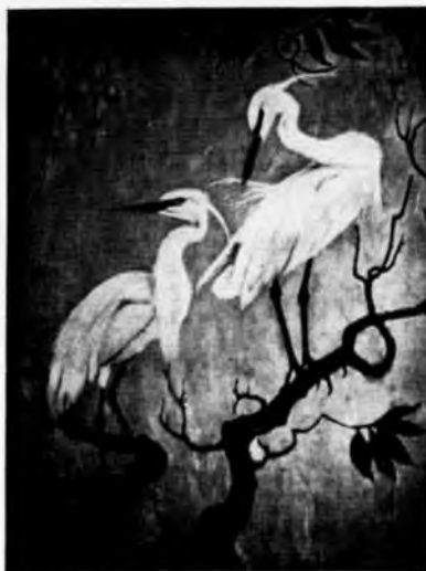
KARL PLATH . . . WHITE HERONS . . . oil