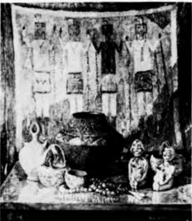
VIVIAN CHURCH HOYT ART OF THE PUEBLOS' . . . oil