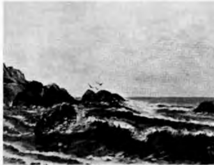
ETHEL GIBBS RAMP LAGUNA BEACH . . . oil