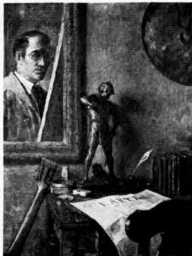
JOSEPH DE SALVI STILL-LIFE OF MYSELF . . . oil