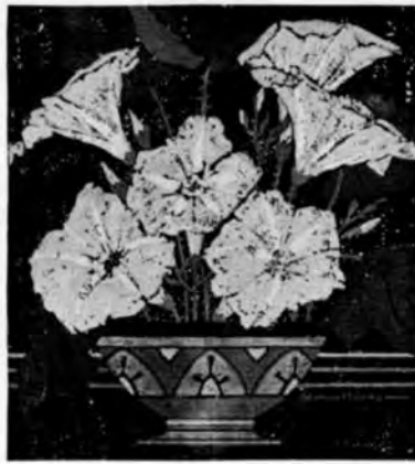
CORNELIA HAWTHORNE MORNING GLORIES . . . batik